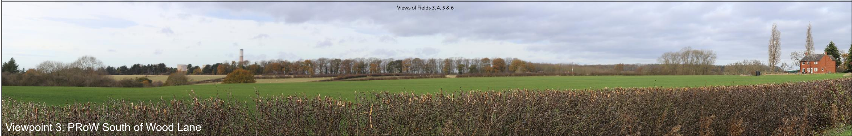
Viewpoint 3: PRow South of Wood Lane