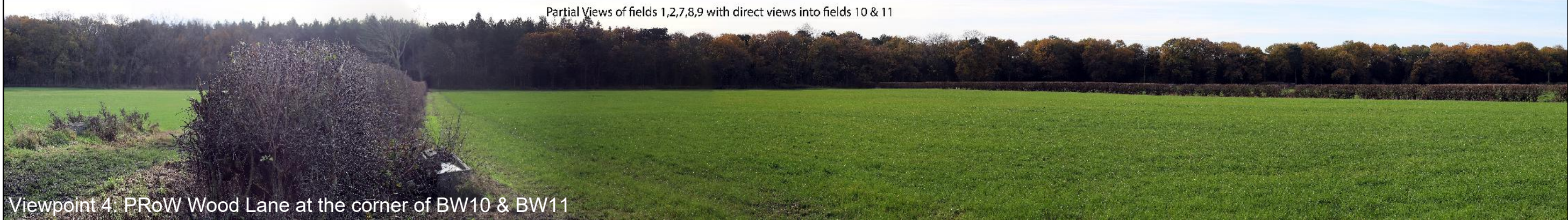
Viewpoint 4: PRow Wood Lane at the corner of BW10 & BW11

Partial Views of fields 1,2,7,8,9 with direct views into fields 10 & 11