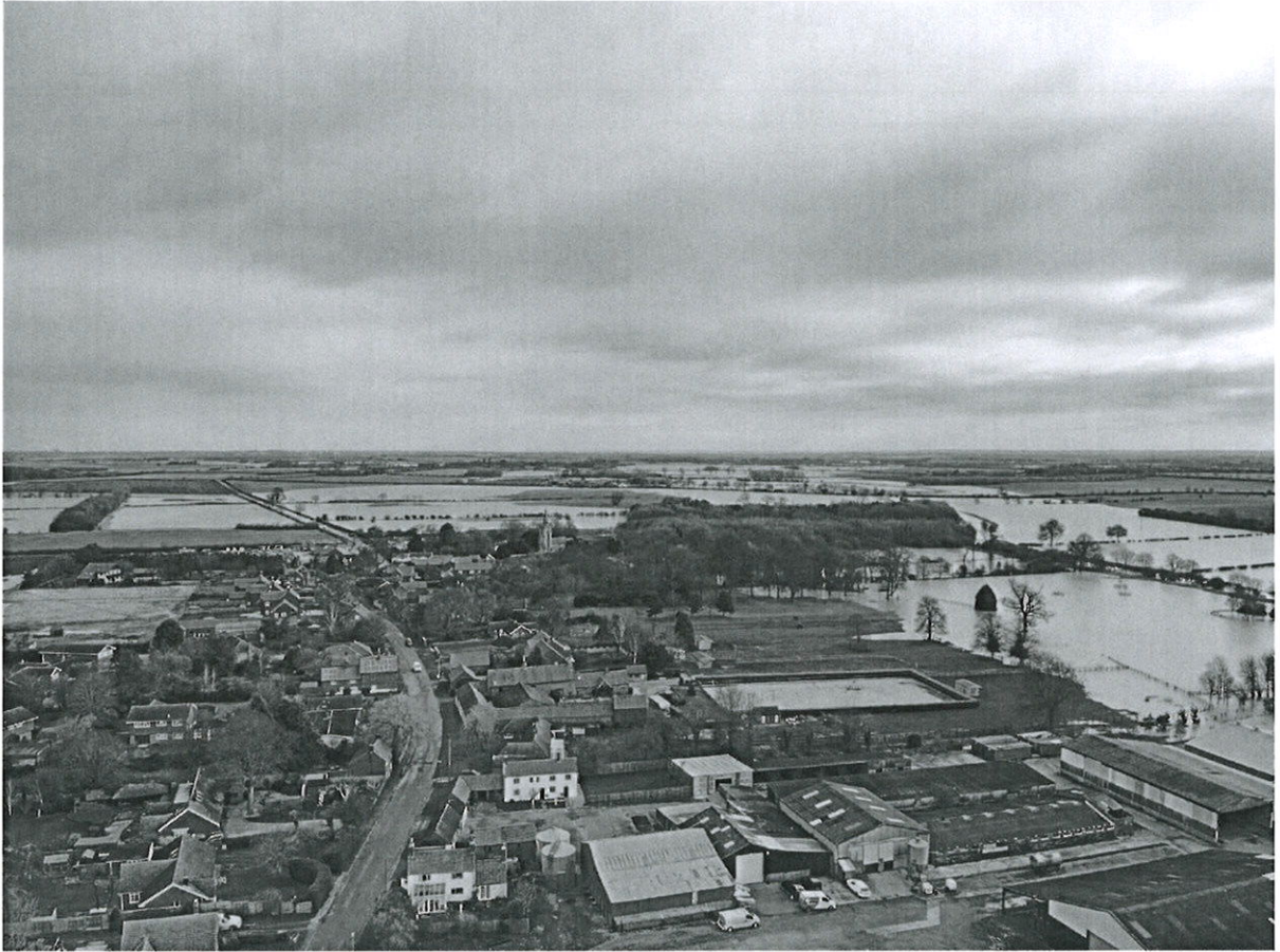
Flooding to the North and East of Thoroton Village 2019/20