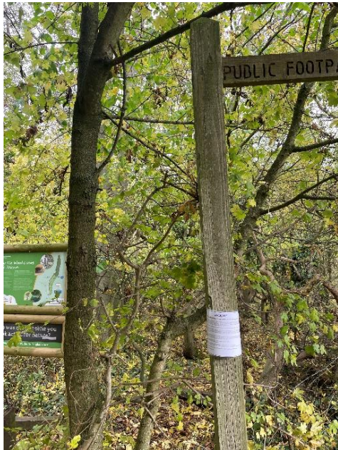
Notice Location 1