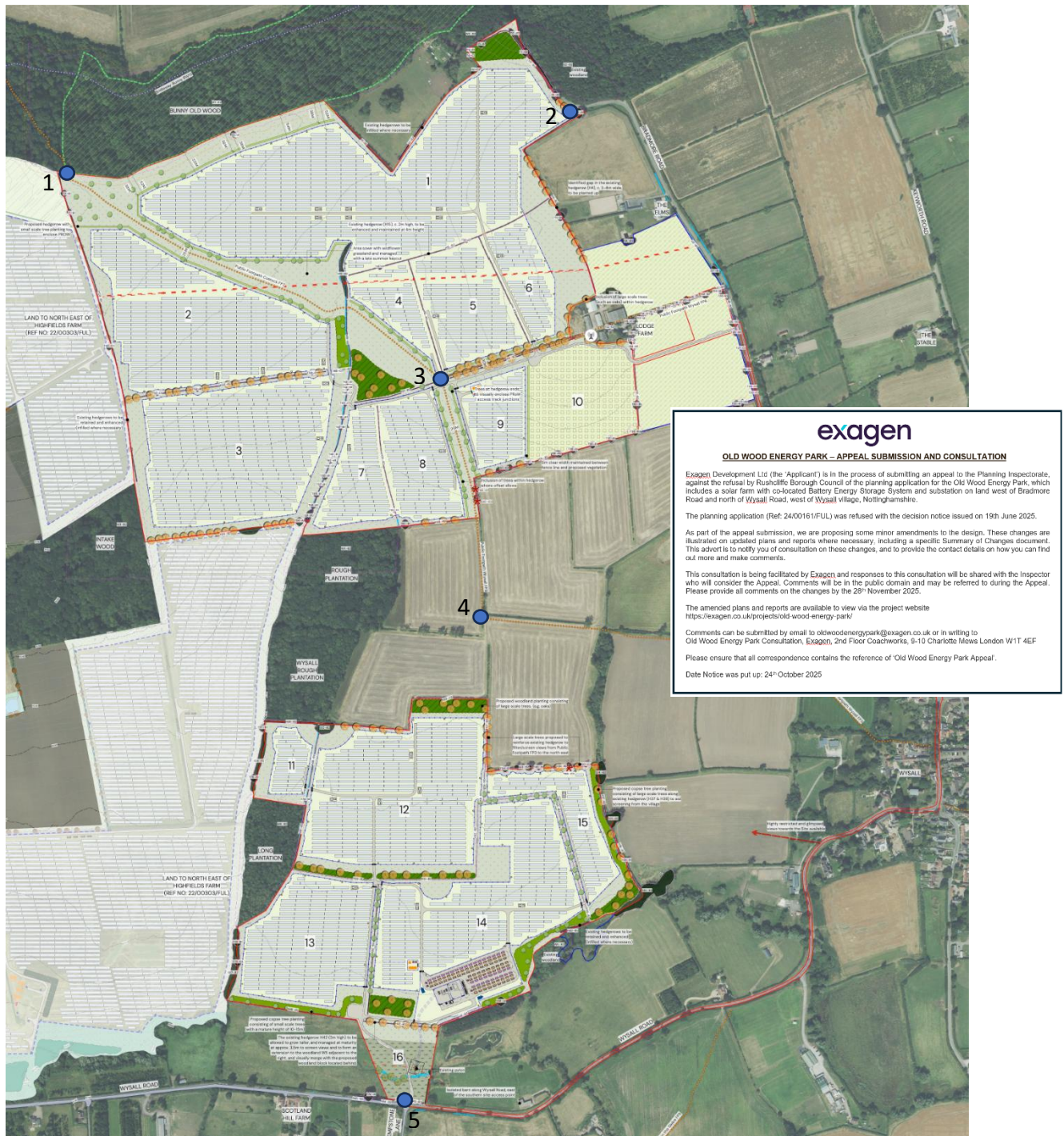
Figure 2 – Site Notice and Locations

were as illustrated on Figure 2 (blue dots); further evidence on these notices (photographs in situ) is provided on the following page.