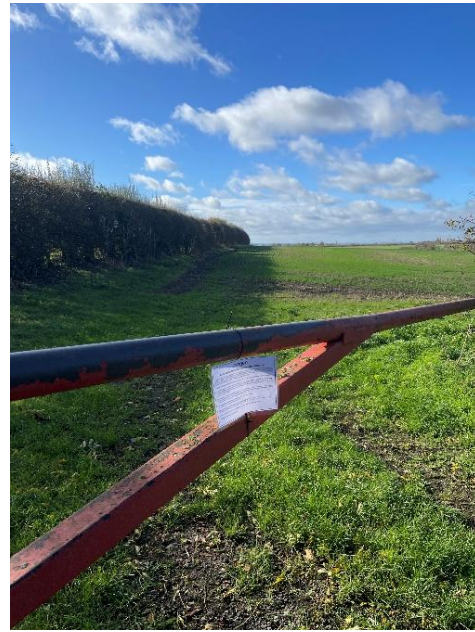
Notice Location 2