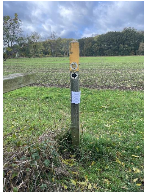
Notice Location 4