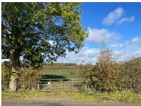
Notice Location 5