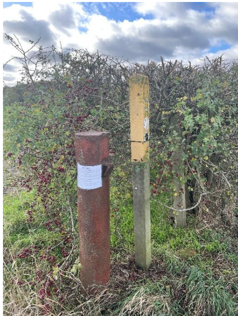
Notice Location 3