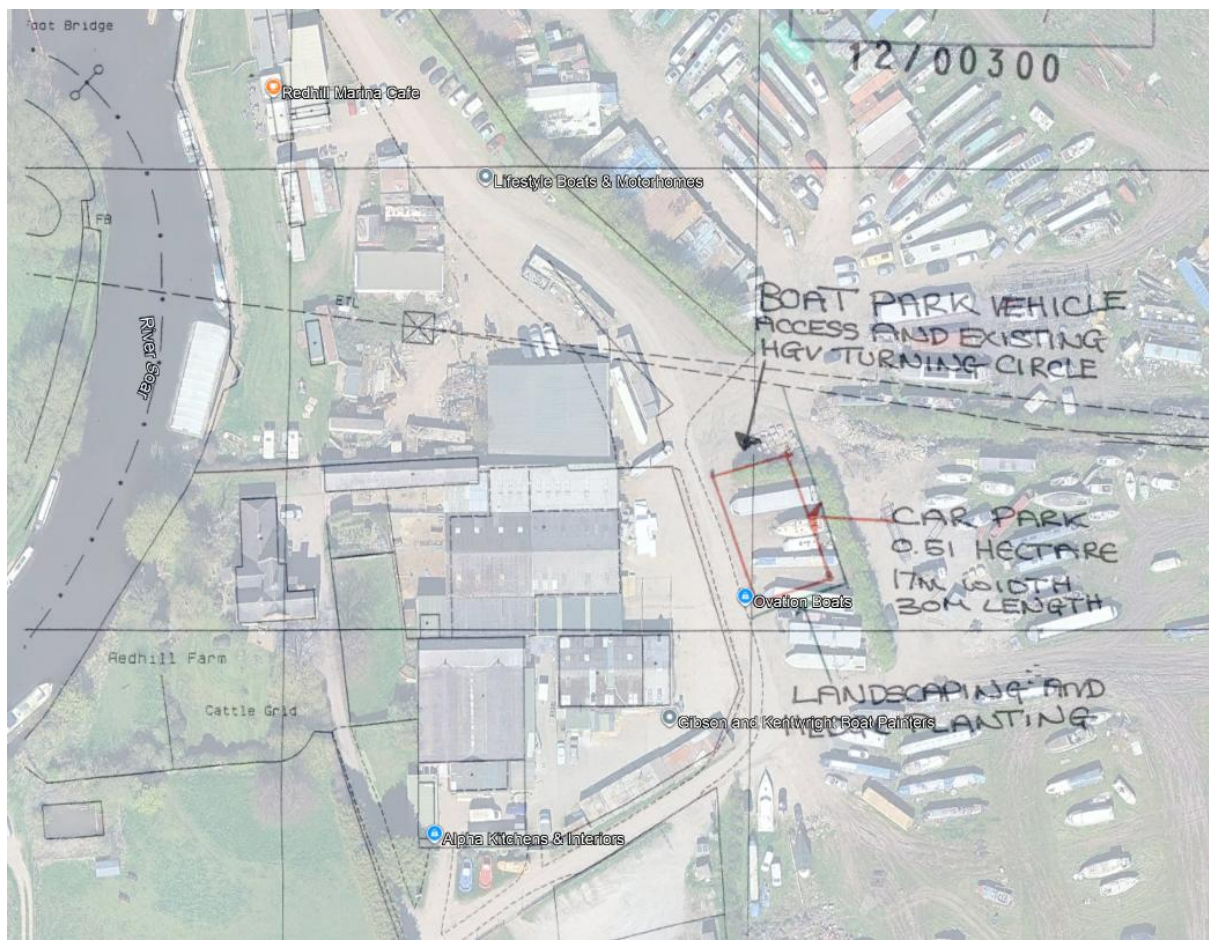
2012 Plan from previous page overlain on 2025 aerial photography to show the position of the 2012 retrospective car park proposal to the west of the hedge which divides it from the appeal site.