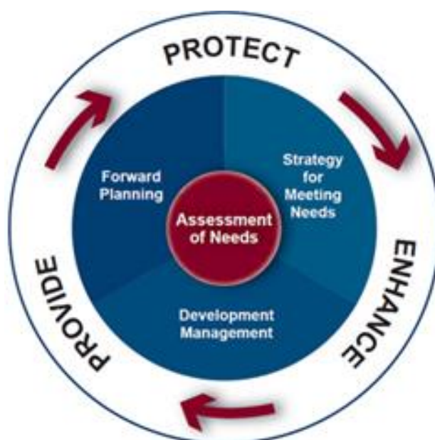
Figure 1: Sport England planning objectives - Protect, Enhance and Provide

To provide new playing pitches where there is current or future demand to do so