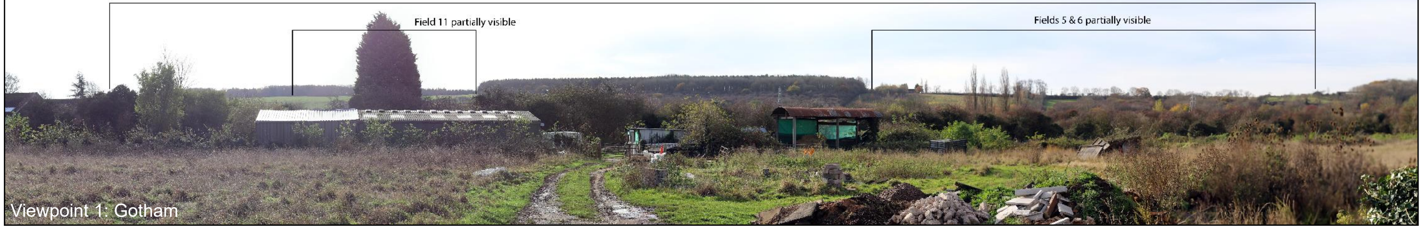
Viewpoint 1: Gotham

Extent of Proposed Development within view