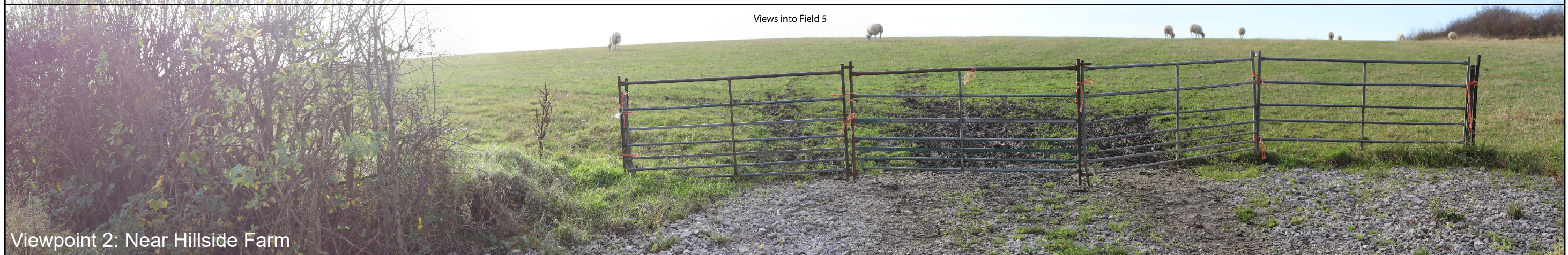
Viewpoint 2: Near Hillside Farm

Extent of Proposed Development within view