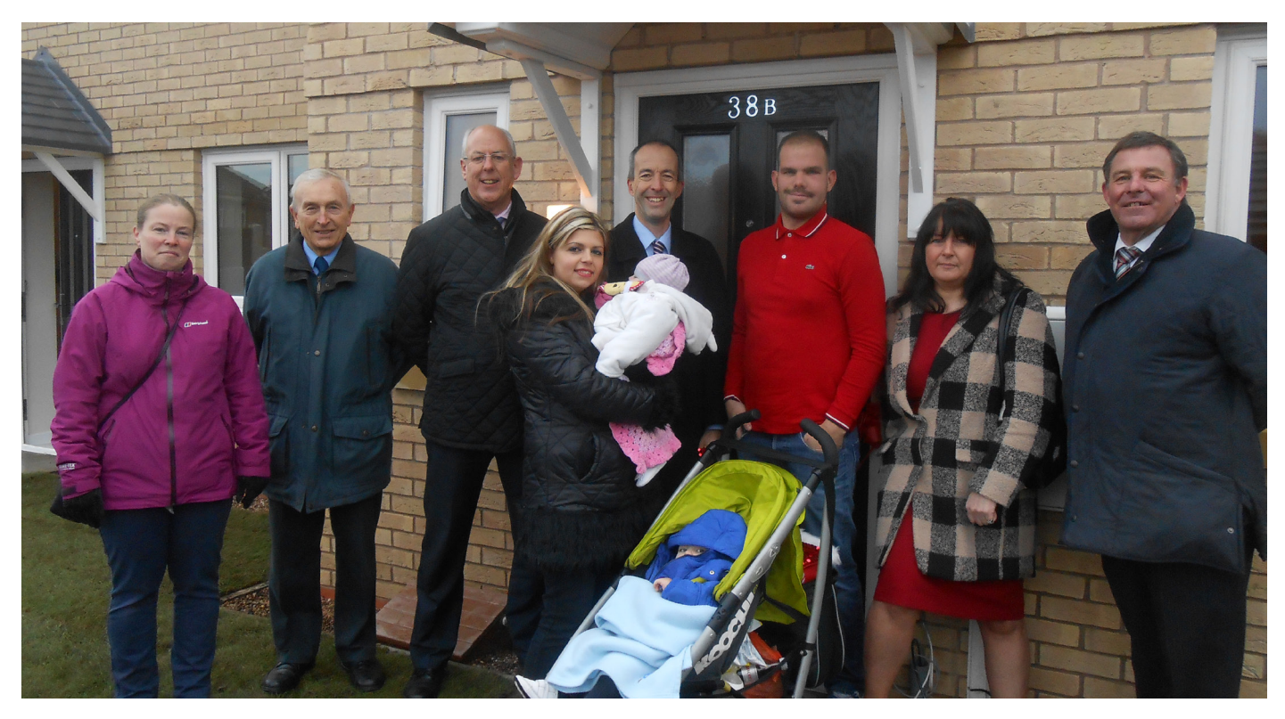
A celebration of new affordable homes for the benefit of the local community

A list of frequently asked questions is included on the next page. If after reading this and the glossary, you require further information on affordable housing in rural communities please contact Strategic Housing in the first instance on 0115 981 9911 or email strategichousing@rushcliffe.gov.uk .